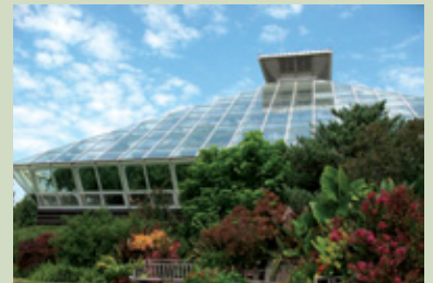
Olbrich Botanical Gardens

Before you head home, stop for a lovely stroll through 16 acres of outdoor display gardens and an indoor tropical conservatory at Olbrich Botanical Gardens. In the outdoor gardens, visit the Thai Pavilion and Garden—the only one in the continental United States and outside of Thailand.