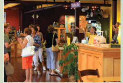
National Mustard Museum

Tonight enjoy samples and a delicious dinner at Death Door's Distillery .