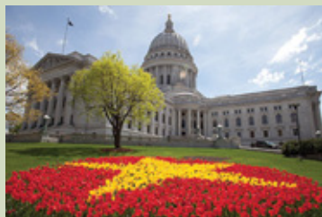
State Capital Building

Continue your afternoon in the Madison area with a visit and tour of Monona Terrace , the Wright-designed conference center on Lake Monona. Stroll the campus of University of Wisconsin Madison and the downtown area with a visit to the State Capital Building .