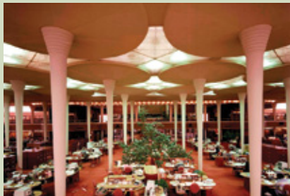
Interior of S.C. Johnson

SC Johnson's global headquarters in Racine, includes the spectacular Frank Lloyd Wright-built SC Johnson Administration Building and Research Tower, as well the award-winning Fortaleza Hall designed by Foster + Partners. The SC Johnson Gallery, At Home with Frank Lloyd Wright , showcases designs and artifacts that explore Wright's influence on families and the home.