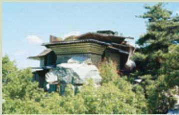
House on the Rock