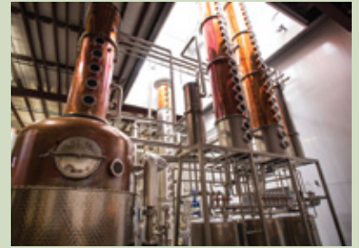
Death Door's Distillery