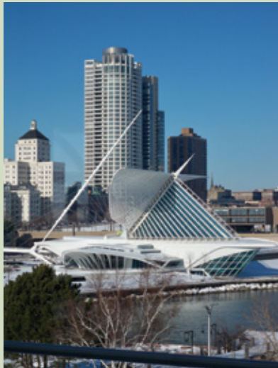
Milwaukee Art Museum

Calatrava-designed building. The Milwaukee Art Museum has an extensive Georgia O’Keefe collection as well as the largest collection of Haitian Art.